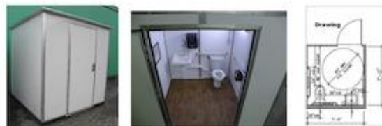
ADA Compliant Lavatory Buildings Exterior Plumbing upgrade Not Shown