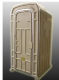
SJSDCSS 520 Comfort Station