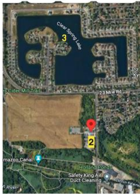
Fig. 2 Aerial View