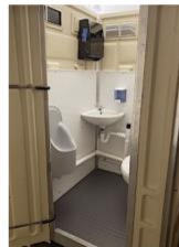
Waterless Urinal Option