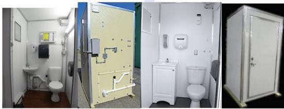
Upscale Lavatory Buildings