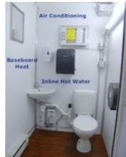
Fig. 2. 4444E Front View