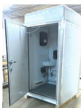
Fig. 1. 4444E with RV door Removable Roof and 1" Walls